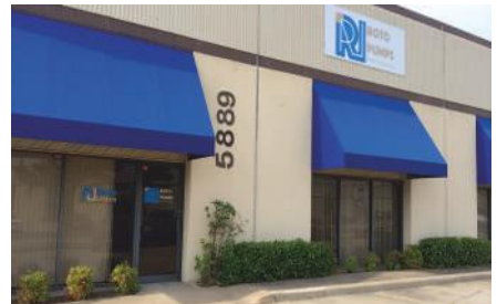
Subsidiary in USA