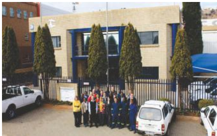
Subsidiary in South Africa