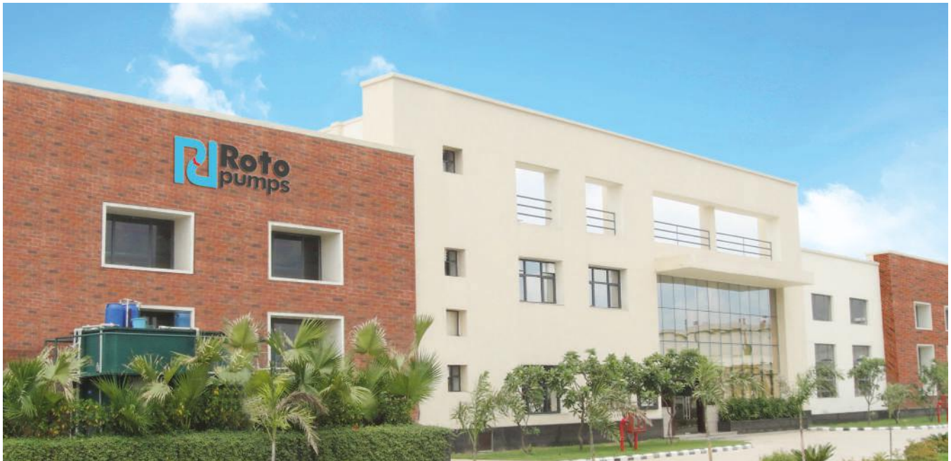
Roto Pumps Limited, Manufacturing Plant, India