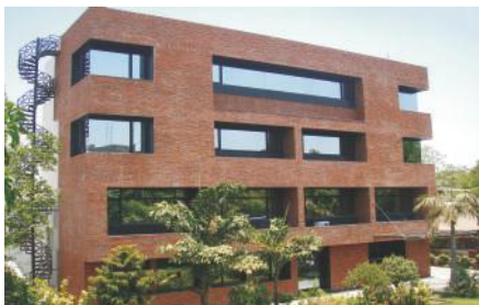
Corporate Office, India