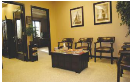
Subsidiary in Germany